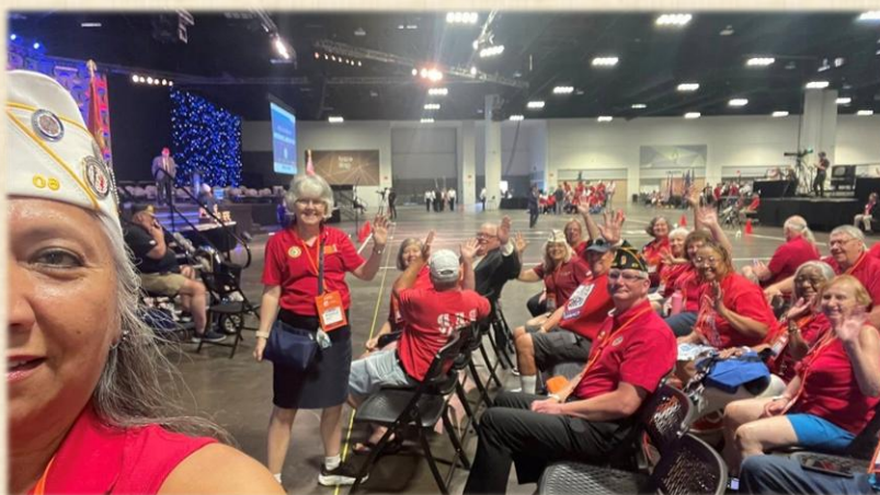
The Best Fans in the hall!