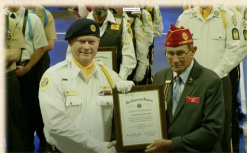
Second Place - .6 points out of First!!!