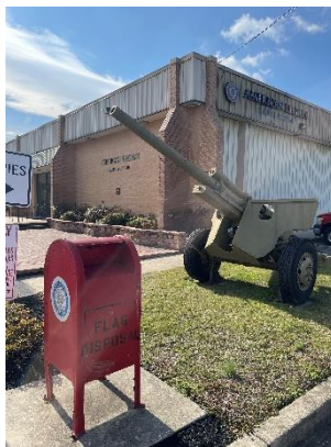
Flag Drop Box