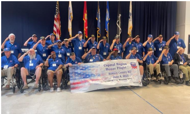
Group photo of all the Honor Flight Veterans

The month of June was exceptionally busy for us. On June 4th, Post 60 and Capital Region Honor Flight organized a welcome home ceremony for over 30 veterans. The event was highly rewarding, and we received an outstanding turnout from our community. It was a commendable way to welcome and honor our veterans.