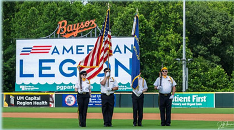
Post 60 Color Guard Presenting the Colors