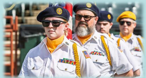
Waiting for the Command