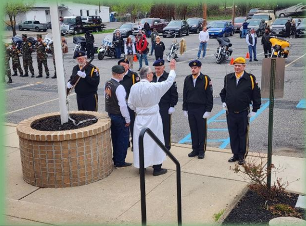
Blessing of the Bikes