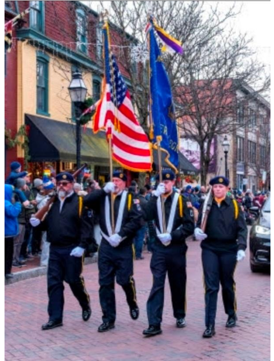
The #1 Color Guard in the state of Maryland