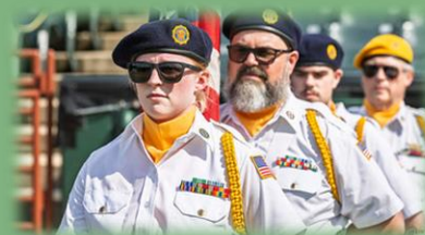
American Legion Regional Baseball Playoffs