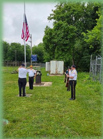
Flag Day Retirement Ceremony