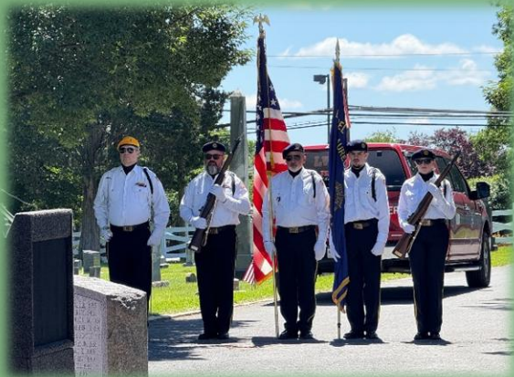
Ivy Hill, Memorial Day