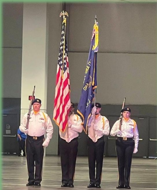
Tampa 2025 THE BIG ONE