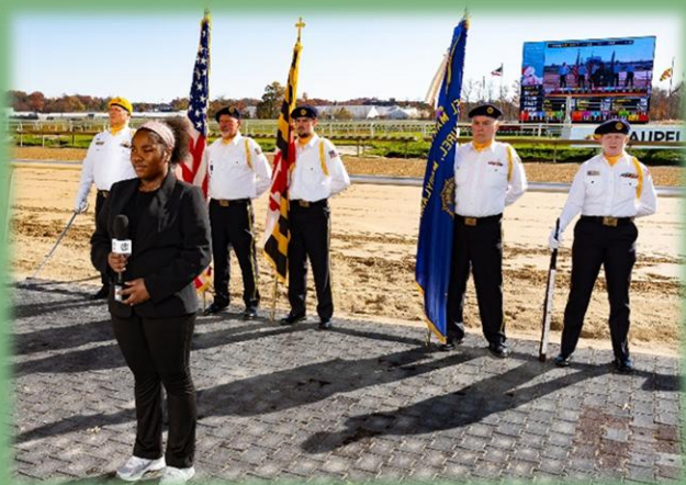
Veteran's Day, Laurel Park Racetrack