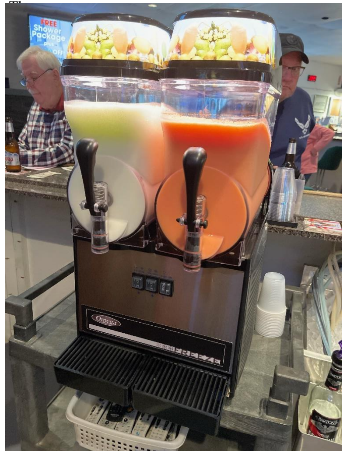
Granita Countertop Frozen Drink System "It's 5 o'clock somewhere!"

Warmer weather means happy hours on the deck and baseball games to watch, just a couple of things to look forward to at Post 60. Our calendar is full of all the great things happening, weekend entertainment and a family day too!