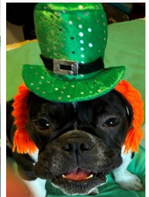
"It's always 5 o'clock at the 'Fun Post!!'"