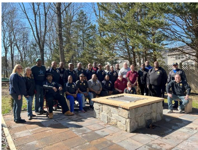
The Caravan visiting Guy Carleton Parlett Post 7 in Crownsville, Maryland.