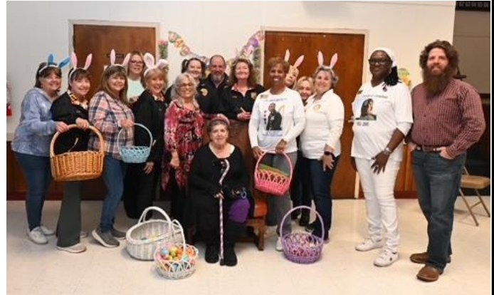
Our VOLUNTEERS that made the Easter Party happen!